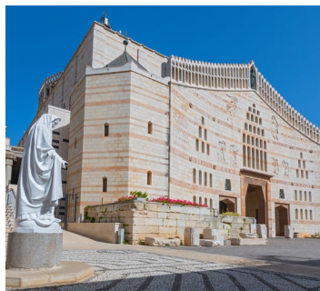
Basilica of the Annunciation Nazareth