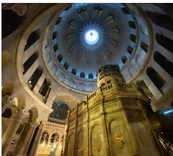
Holy Sepulchre Tomb of Jesus