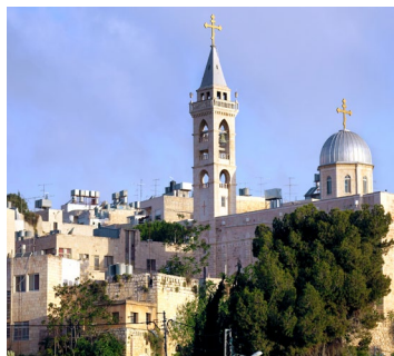
Church of the Nativity Bethlehem