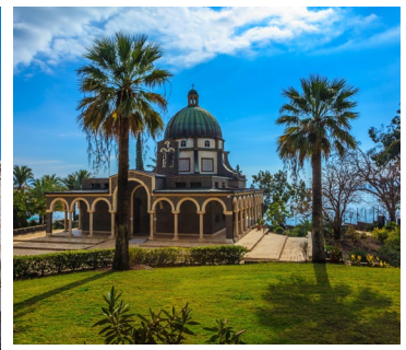
Mt. of Beatitudes Sermon on the Mount

cousin Elizabeth. After a fulfilling day, we'll enjoy a delicious dinner and settle in for the night at our hotel in Bethlehem.